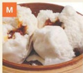
Bánh Bao Xả Xiu BBQ Pork Buns 叉燒飽