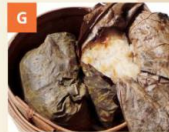
Bánh Nếp Gà Sticky Rice with Chicken 糯米雞