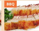
Thịt Quay Roast Pork 燒肉