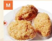
Bánh Chiên Khoai Môn Deep Fried Taro Dumplings 芋角