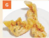
Bánh Xếp Tôm Chiên Deep Fried Prawn Dumplings 炸蝦角