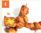
Gà Xiên Sa Tế Satay Chicken Skewers 沙嗲雞串