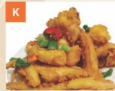
Râu Mực Chiên Giòn Deep Fried Squid Tentacles 炸魷魚鬚