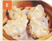
Bánh Xếp Vi Cá Shark Fin Dumplings 魚翅餃