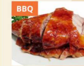
Vịt Quay Roast Duck 燒鴨