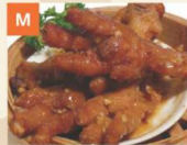
Chân Gà Sốt Tàu Xi Chicken Feet in Black Bean Sauce 鳳爪