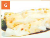
Bánh Cuốn Tôm Steamed Rice Noodles w/ Prawn 鮮蝦腸粉