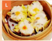
Xiu Mai Steamed Prawn & Pork Siu Mai 燒賣