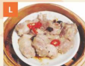
Sườn Sốt Tàu Xi Pork Ribs in Black Bean Sauce 豉汁排骨