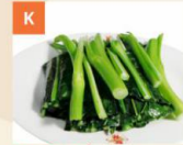
Rau Cải Sốt Hào Chinese Broccoli Topped with Oyster Sauce 油菜