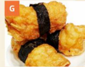
Tôm Cuốn Chiên Deep Fried Prawn & Seaweed Rolls 紫菜蝦條