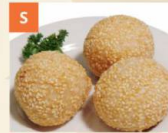
Bánh Chiên Nhân Đậu Đỏ Deep Fried Sesame Balls w/ Red Bean Paste 煎堆仔(豆沙)