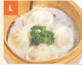
Bánh Xếp Thượng Hải Shanghai Pork Dumplings 小籠包