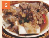
Bò Né Tấu Đen Beef Ribs in Black Pepper Sauce 黑椒牛仔骨