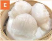
Há Cảo Prawn Dumplings 蝦餃