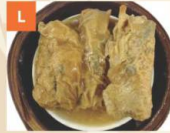
Tàu Hủ Kỳ Cuốn Tôm Thịt Bean Curd Rolls with Prawn & Pork 鮮竹卷