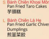
L Bánh Chiên Lá He Pan Fried Garlic Chives Dumplings 煎韭菜餃