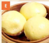
Bánh Bao Sữa Trứng Muối Salty Egg Custard Buns 金黃流沙包