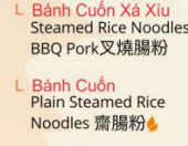
L Bánh Cuốn Xả Xiu Steamed Rice Noodles w/ BBQ Pork 叉燒腸粉