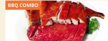
Thịt Quay 2 Món BBQ Plate Combo (Select Any Two From Above) 燒味雙拼(以上任選兩種)