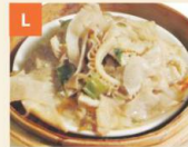
Bò Lá Lách Beef Tripe with Ginger & Shallots 牛柏菜