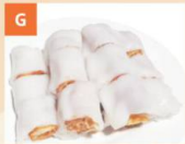
Bánh Cuốn Dầu Cha Chua Steamed Rice Noodles w/ Dough Fitters 炸兩