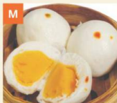
Bánh Bao Sữa Steamed Custard Buns 奶皇包