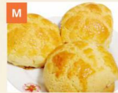
Bánh Nướng Nhân Sữa Baked Custard Buns 奶皇菠蘿包