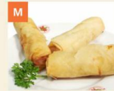
Chả Giò Spring Rolls 春卷