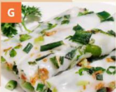
Bánh Cuốn Tôm Khô Hành Steamed Rice Noodles w/ Shallots & Dried Shrimps 蔥花蝦米腸