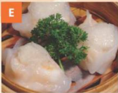
Bánh Xếp Sò Diệp Scallop Dumplings 帶子餃