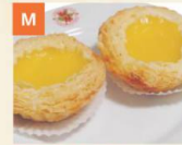
Bánh Nướng Trứng Egg Tarts 蛋撻