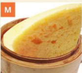
Bánh Hấp Mả Lai Steamed Sponge Cake 馬拉糕