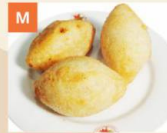
Bánh Chiên Mặn Deep Fried Combination Dumplings 鹹水角