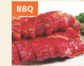
Xả Xiu BBQ Pork 叉燒