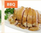
Gà Xi Dầu Soy Sauce Chicken 豉油雞