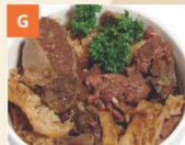
Bò Thập Cẩm Nấu Củ Cải Mixed Beef Tripe with Turnip 蘿蔔牛雜