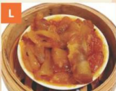
Gân Bò Beef Tendon 牛筋